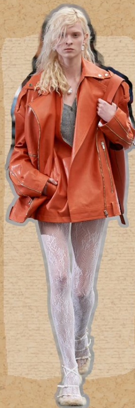
ROKH FW23 PARIS FASHION WEEK