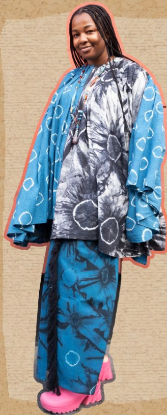
SS24 LAGOS FASHION WEEK