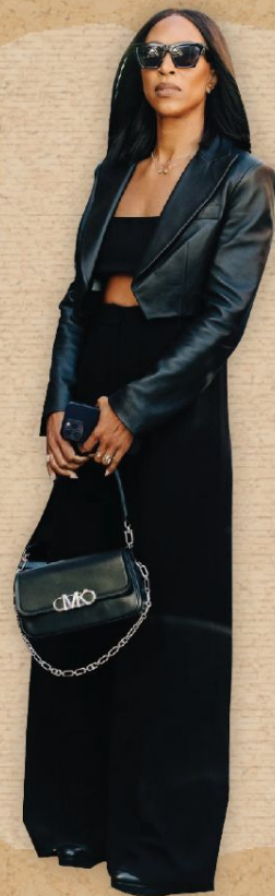
FW24 LONDON FASHION WEEK