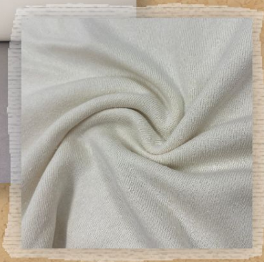
Organic Cotton Knit 100% cotton