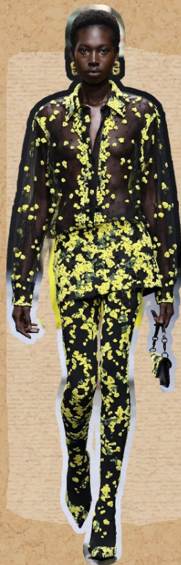
VALENTINO SS23 PARIS FASHION WEEK