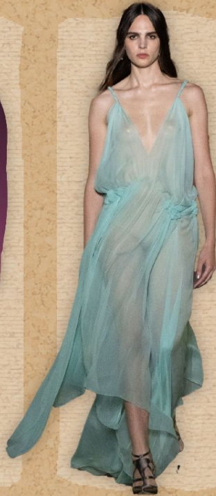
ALBERTA FERRETI RESORT SS23