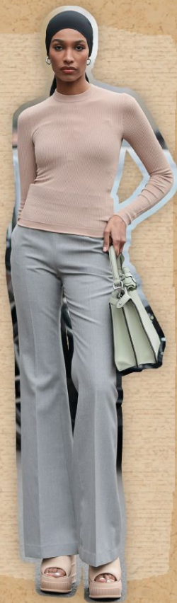
FW23 MILAN FASHION WEEK