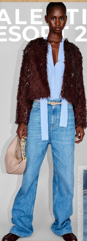
Laser Whiskered Denim 100% cotton