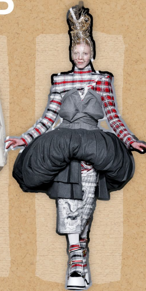
THOM BROWNE FW23 NEW YORK FASHION WEEK