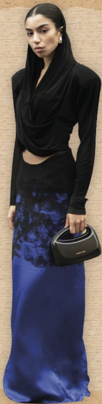
FW23 NEW YORK FASHION WEEK