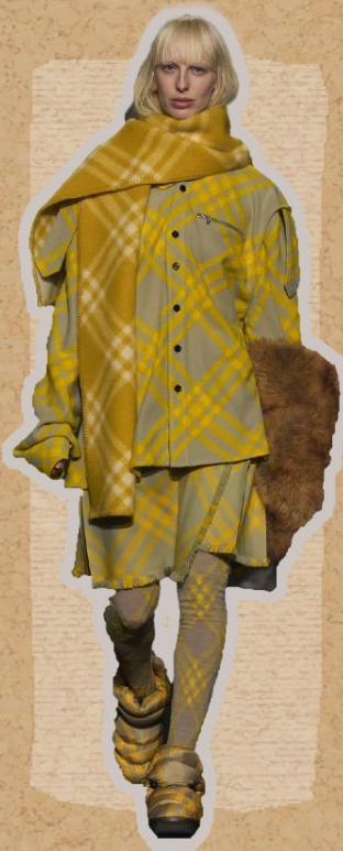
BURBERRY FW23 LONDON FASHION WEEK