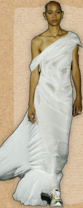
DIOR CRUISE 2022