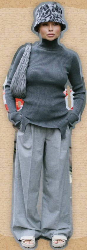
FW24 MILAN FASHION WEEK