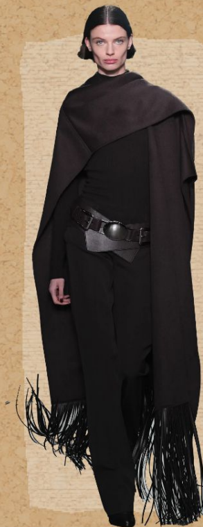
MICHAEL KORS FW23 NEW YORK FASHION WEEK