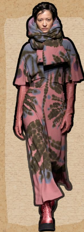
ALTUZARRA FW23 NEW YORK FASHION WEEK