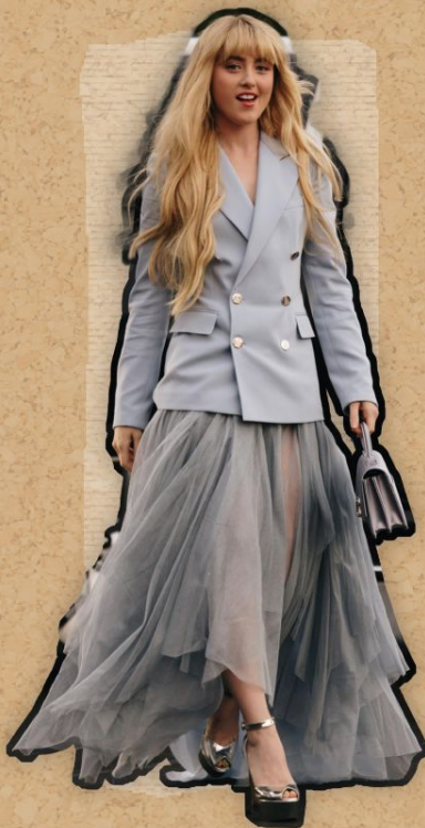
FW24 NEW YORK FASHION WEEK