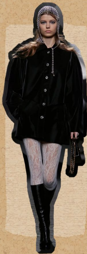
CHANEL FW23 PARIS FASHION WEEK