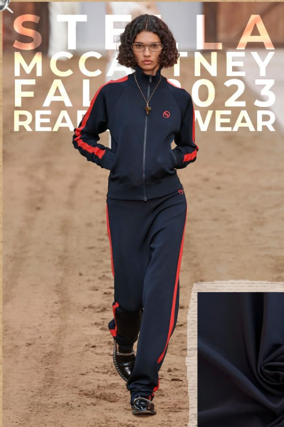
STELLA MCCARTNEY FALL 2023 READY-TO-WEAR