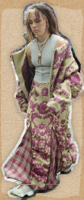
SS24 LONDON FASHION WEEK