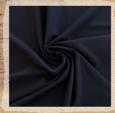
Repreve® Nylon Recycled post-consumer waste