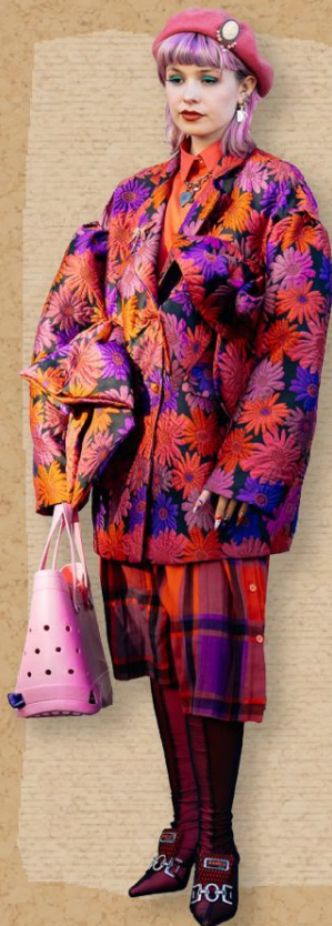
FW23 PARIS FASHION WEEK