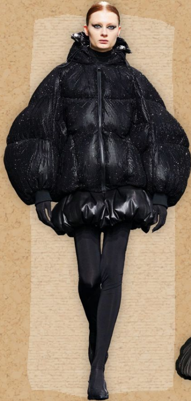
CHEN PENG FW23 PARIS FASHION WEEK