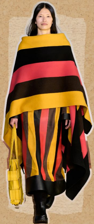
GABRIELA HEARST FW23 NEW YORK FASHION WEEK