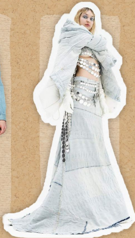
MARC JACOB SS22 NEW YORK FASHION WEEK