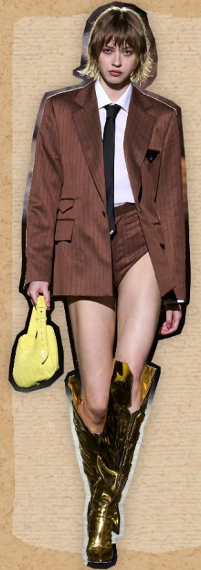
GCDS FW23 MILAN FASHION WEEK