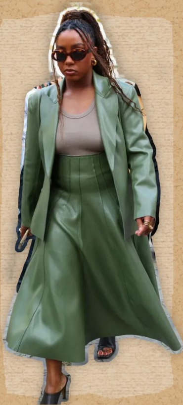
FW23 PARIS FASHION WEEK