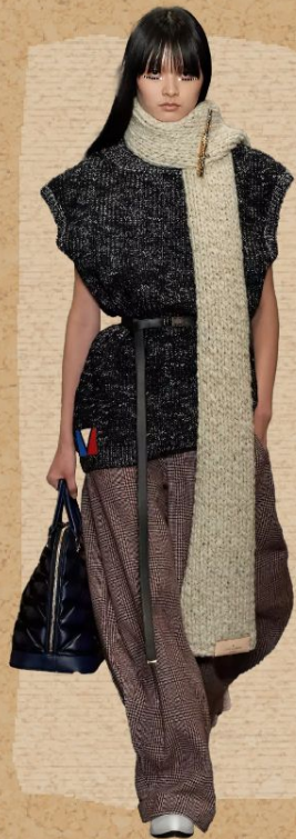
LOUIS VUITTON FW23 PARIS FASHION WEEK