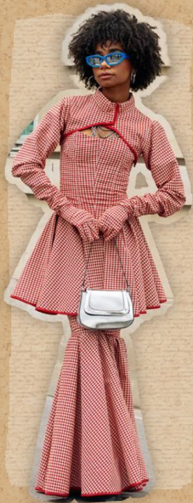
FW23 PARIS FASHION WEEK