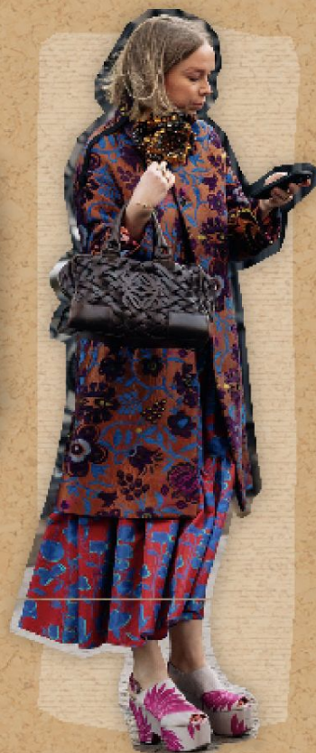
FW23 NEW YORK FASHION WEEK