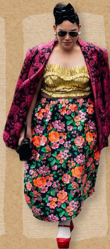
FW23 PARIS FASHION WEEK