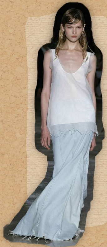
JASON WU SS23 MILAN FASHION WEEK