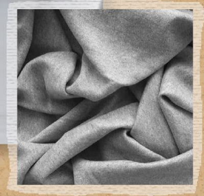
Supima® Cotton 100% cotton