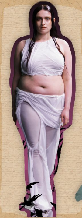
DI PETA FW22 PARIS FASHION WEEK