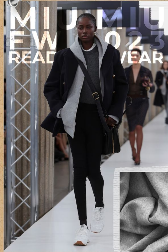
MIU MIU FW 2023 READY-TO-WEAR