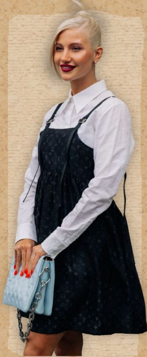
FW23 PARIS FASHION WEEK