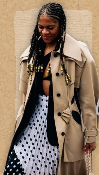
FW23 PARIS FASHION WEEK