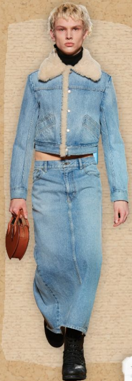
COACH FW24 NEW YORK FASHION WEEK